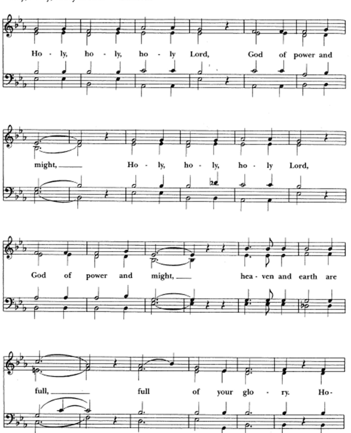
continued on next page